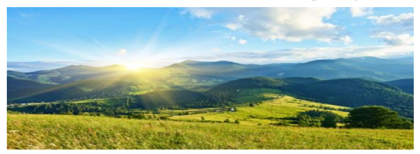
Where do you go next after you have completed the Yorkshire 3 Peaks? Well, it must be to complete the National 3 Peaks within 24 hours, of course!